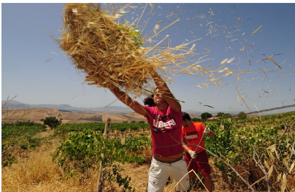
Fig. 3 The activists of Libera working on the confiscated lands in the summer with t-shirts that state “Estate Liberi” (translated “Free Summer”)

The idealization of their struggle, reference to the regional patterns, policies to cooperate with local people and civil society are echoed profoundly through the works of Libera Terra and its cooperative institutions. Therefore, not only the confiscated lands on which they work to realize their ideals but also the crops, fruits and vegetables that they gather from these fields turn to the idealized icons when these products find a place in the supermarkets or dining tables of the Italian citizens. More strikingly, these products are stamped and marked with the logos of Libera Terra, which utter anti-Mafia slogans at the