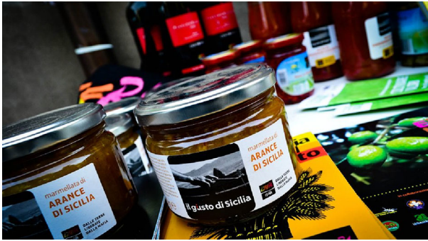
Fig. 4 The marmalade that was produced from the confiscated lands displays an anti-Mafia slogan and wordplay on these iconic figures, as shown in the photo— il g(i)usto di Sicilia —the taste (justice) of Sicily. This product can be purchased in the markets and events of Libera Terra

same time. For instance, one may encounter one of these products in a supermarket and may read the slogan Il g(i)usto del legume ( il gusto means the taste or flavor and il giusto is justice) on the cover of a bottled vegetable. One may observe similar slogans and etiquettes on nearly every product of Libera Terra and its cooperative institutions (see Fig. 4).