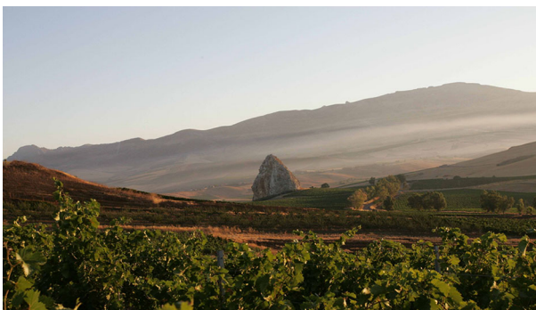
Fig. 2 A confiscated vineyard in Sicily, which reflects the idealisation and beauty of a landscape through the works of Libera Terra. The organisation uses various landscapes photographs with the products on these lands to mobilise more people and to take more public attention

“The products marked with “Libera Terra”, with their gusto of legality and responsibility, arrive to the houses and tables of the numerous Italians, and perhaps